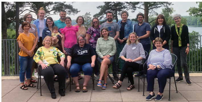
Pastors, congregational staff members, and lay leaders gathered in Collegeville for the final Communities of Calling Initiative meeting in June 2023.

The Collegeville Institute Seminar on Vocation and Disability , in partnership with Western Theological Seminary, continued its exploration of disability as a particular site of human vocation. The Seminar held two in-person meetings this year in Collegeville and Holland, MI, and sponsored a symposium for 150 attendees online and in-person in Holland in July that focused on disability and the callings of all the baptized into the inter-woven fabric of vocations in the body of Christ. In the next year, the Seminar is meeting for a writing week in Collegeville and sponsoring a series of in-depth interviews as a source for further reflection and writing.