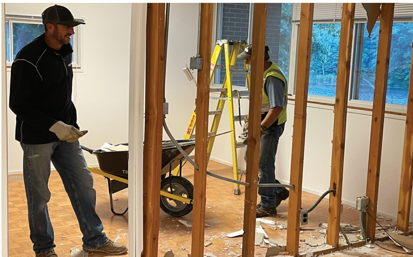
Demolition in the Butler Center is underway!

The renovation reflects our unwavering commitment to accessibility and inclusivity as we provide spaces that meet the needs of our guests. As we look toward the future, we are excited about the positive impact these completed projects will make in the experience of our guests and program participants.